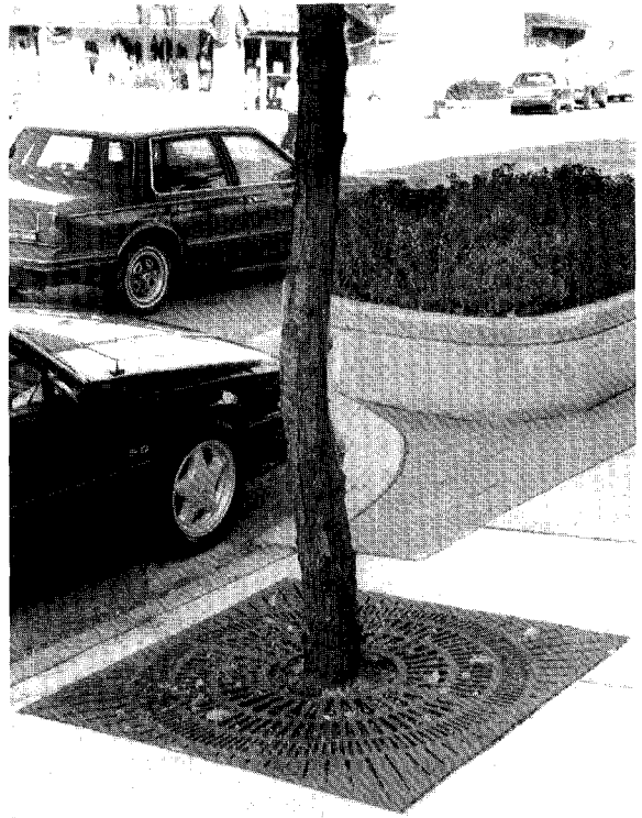
Figure 2. Grade level and raised planters in Downers Grove.

and two sites were within a wide, road-level median. Traffic counts at each site show essentially equal traffic levels (2). The narrow median is 3 m (10 ft) wide and raised 0.8 m (2.5 ft) above the roadway (Figure 1). The wide median is about 30 m (100 ft) across and level with the roadway. One surface soil sample (0-15 cm deep, 0-6 in) was gathered on 28 December 1992 and on 30 March 1993 in the center of each median site.