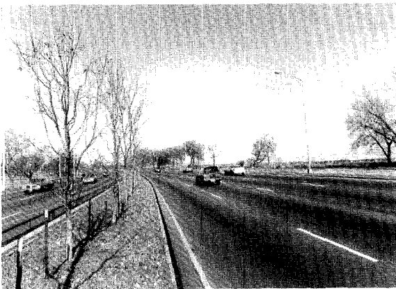
Figure 1. Narrow median planter along Lake Shore Drive, Chicago, with Lake Michigan in the right background. The planter is raised 0.8 m (2.5 ft) above the roadway.

Lake Shore Drive has eight lanes of traffic and a 65 km per hour (40 mph) winter speed limit. Four sites on the Drive were chosen to represent various roadway and median characteristics that might affect deicer application, dispersal, and deposition. Two sites were within a narrow, raised median