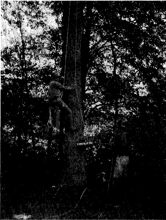
Figure 3. The hoist in use lifting a climber by means of a false crotch. Note, that the climber is tied in with a taut-line hitch for security.