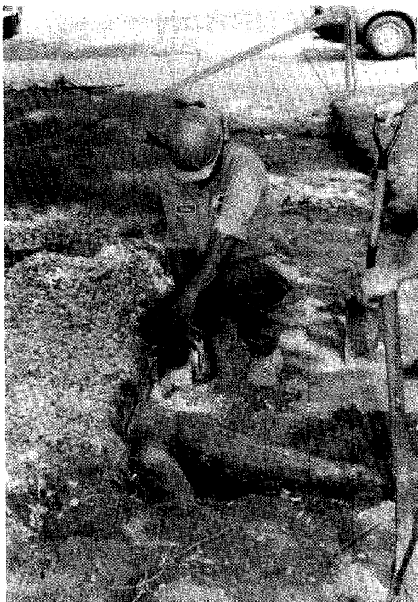
Fig. 1. Removal of surface roots from a parkway elm underneath a public sidewalk that is being replaced. The sidewalk was raised and was hazardous to pedestrians.

are also accomplished to eliminate safety hazards such as raised sidewalks, broken curbs and the widening of narrow streets for accessibility of emergency vehicles.