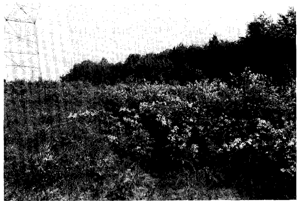
Figure 6. Shrub-forb-grass cover type in May 1990 that developed after a selective basal spray applied in 1987 on the Piedmont ROW.