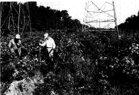
Figure 3. Tree sprout-shrub type in May 1990 dominated by white ash that developed after handcutting in 1987 on the Piedmont ROW. Blackberry was the dominant shrub.