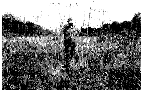
Figure 5. Forb-grass cover type in May 1990 dominated by goldenrod, cinquefoil and fall panic grass that developed after a foliage spray applied in 1987 on the Piedmont ROW.