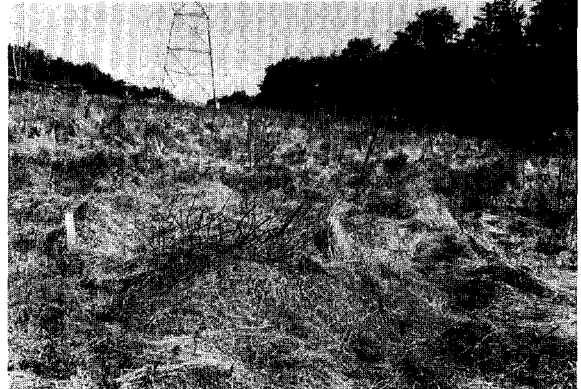
Figure 4. Grass-forb cover type in May 1990 dominated by fall panic grass, broomsedge and goldenrod that developed after mowing plus herbicide applied in 1987 on the Piedmont ROW.