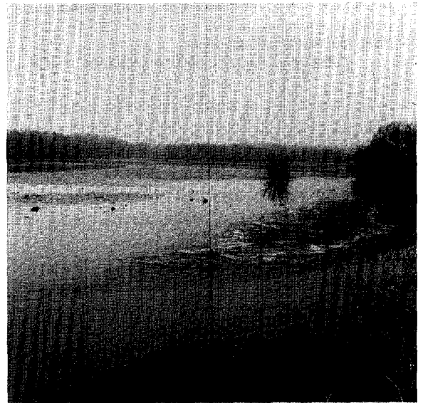
Figure 2. From the same aspect as Figure 1, the wetland is now mostly devoid of aquatic vegetation.

In addition, analyses of bottom sediments indicate relatively uncontaminated conditions, since heavy industry has been lacking in the watershed. It is also important to note that there has been a measurable reduction in nutrient loadings over the