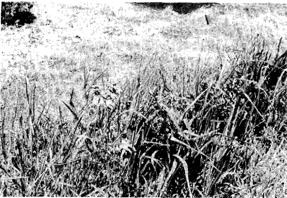
Figure 1. The greatest decrease in soil moisture occurred in bare soil plots where red maple and azaleas were wilting and dying due to weed competition.

Miscellaneous. Runs of voles were more prevalent under plastic and the fabrics/film than under the bare ground, herbicide or mulch-alone coverings (Figure 4). Since voles are vegeterians, their increased presence under the fabrics/films could potentially increase tree and shrub injury via their feeding on roots. Davies (3) noted an increase in field vole nesting under polyethylene