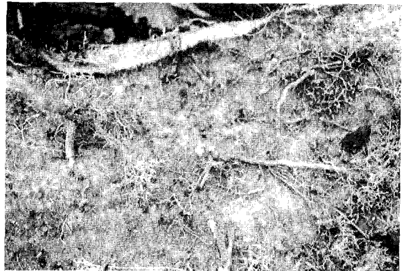
Figure 3. Red maple roots growing in, through and atop a spunbonded fabric.