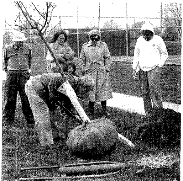
Figure 3. Local community planting trees.

The remaining Phase I trees and all stumps were