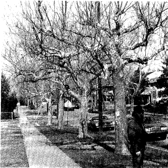
Figure 1. Sycamore before removal.

Phases 2 and 3, scheduled for 1990 and 1991, will involve similar numbers of trees. Prior to tree removal, it should be noted that all trees slated for removal were posted with signs printed by Patapsco High School students. The signs informed area residents of the program and of the impending cut downs. This action afforded adjacent homeowners an opportunity to refuse removal.