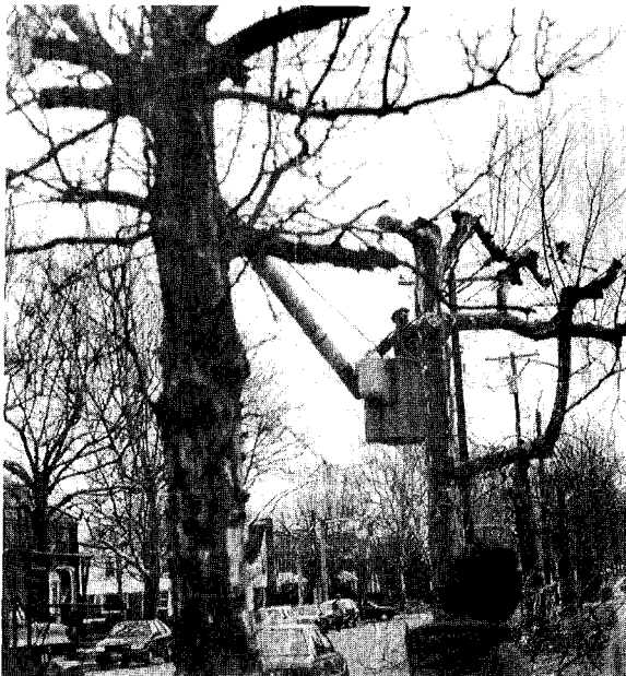
Figures 2. Contractor removing trees.