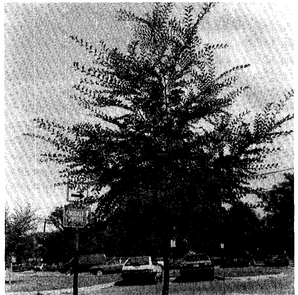
Figure 2. David elm ( Ulmus davidiana ) is an elm from northern China that thrives on calcareous clayey soil.