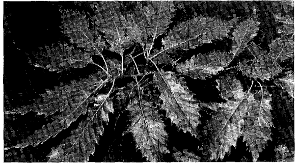
Figure 1. Chinquapin oak ( Quercus muhlenbergii ) occurs in nature on calcareous soils.

Throughout northeastern Illinois the glacial till underlying the natural soils contains countless fragments and particles of dolomitic limestone. In areas of urbanization, calcareous glacial material is commonly mixed with surface soil materials when large-scale landscape modifications are made. Urban soil often has pH values too high for proper growth of many tree species. Downtown areas appear to have soils progressively alkalinized by runoff from limestone and concrete surfaces that dominate the city center. The recent perceptible loss of sculptural detail on the facades of downtown buildings suggests that acid rain may be accelerating the dissolution of limestone and