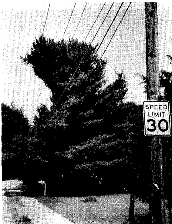
Fig. 2. This white pine was pruned to keep wires clear. Its natural shape was destroyed and flush cuts opened the stem to the risk of infection and decay.

Utility lines must be kept clear. In the process of clearing lines, the concerns for tree energy systems and quality of tree health is easily lost. This is understandable. Few customers with no power, or stockholders with no dividends will be very concerned about tree energy systems. How can we reconcile the desirability of healthy, growing trees with functioning, clear power lines? There is one solution—remove all trees under power lines, and do not plant new ones. Many have been saying this for years, but it is unlikely that we will see this happen across the nation in our lifetime. So now what? We need to set up a plan of action. Plans are easy; action is difficult.