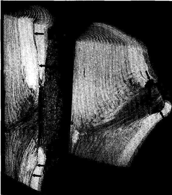
Fig. 3. Oak branches are from the same tree. B was pruned flush and A was pruned with a proper cut. Both are closing well but B has extensive decay in the stem above and below the cut where A has none. Proper pruning cuts lower the potential for hazards and may reduce the frequency of sprouting.