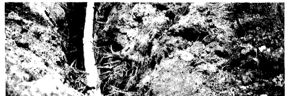
Fig. 1. Trenching within two feet of this Quercus agrifolia in Berkley, California is risky in this year of drought.

Several years ago, I conducted a test to determine why 65 uniform 3-year-old iron bark eucalyptus trees ( Eucalyptus sideroxylon ) grew vigorously after being severely potbound in one-gallon containers. I trenched 5 feet deep and 18 inches from the trunk on one side. I then directed