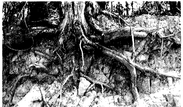
Fig. 3. The downward growing sinker roots are important to tree survival after root severance.

Lee Payne, retired researcher from the Pacific Southwest Forest and Range Experiment Station,