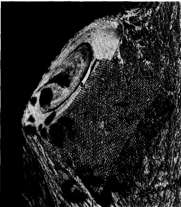
Figure 2. Sticky-coated hardware screen trap attached to pruning wound.

Trap catches were determined by actual count and summarized by treatment. A chi-square analysis was used to test for differences in numbers of captured male and female beetles. Beetle catches at and away from pruning sites were compared with a Wilcoxon matched-pairs signed-ranks test. A Wilcoxon two-sample test was used to analyze for treatment differences in beetle catches at pruning sites with or without wound dressing (11).