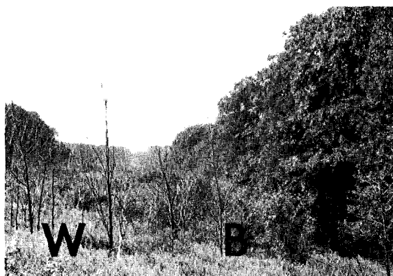
Figure 2. Stem-foliage sprayed ROW with hayscented fern in the wire zone (W) and witch-hazel in the border zones (B).

Deer browsing. Browsing of woody and herbaceous vegetation on ROW treatment units in the forest was evaluated in 1984 by the classes listed below (Aldous, 1944):