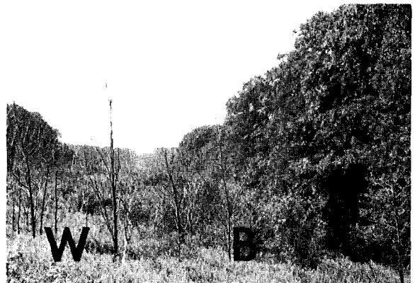
Figure 2. Stem-foliage sprayed ROW with hayscented fern in the wire zone (W) and witch-hazel in the border zones (B).

Deer browsing. Browsing of woody and herbaceous vegetation on ROW treatment units in the forest was evaluated in 1984 by the classes listed below (Aldous, 1944):