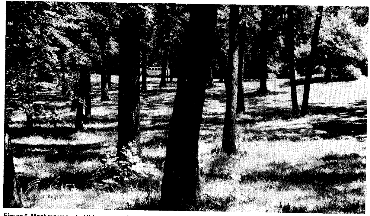
Figure 5. Most groups rated this scene as having too many trees. (Scenic beauty rating = 3.72; number-of-trees rating = 4.78; foreground tree density = 97 trees/acre or 240 trees/ha).