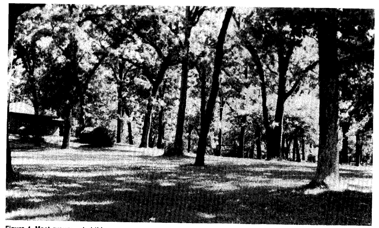
Figure 4. Most groups rated this scene as having about the right number of trees (Scenic beauty rating = 4.79; number-of-trees rating = 3.80; foreground tree density = 42 trees/acre or 104 trees/ha).