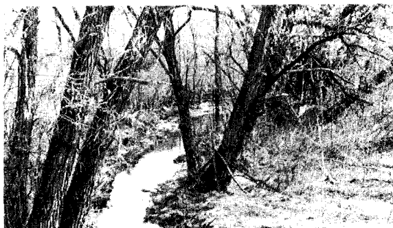
Figure 1. Scenes with highest average preference ratings (over 4.5 on 5-point scale).