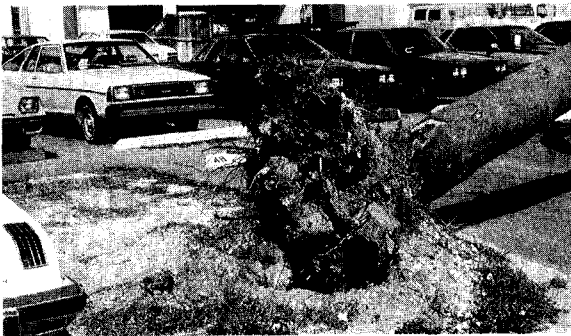
Figure 2. One does not have to be a prophet to know that this tree was a prime candidate for windthrow. In fact, it blew over like a matchstick in a thunderstorm in which winds reached 40 mph (estimated). Note absence of root system. Trees which are seriously stressed due to construction damage, insects or diseases should be removed to protect life and property.