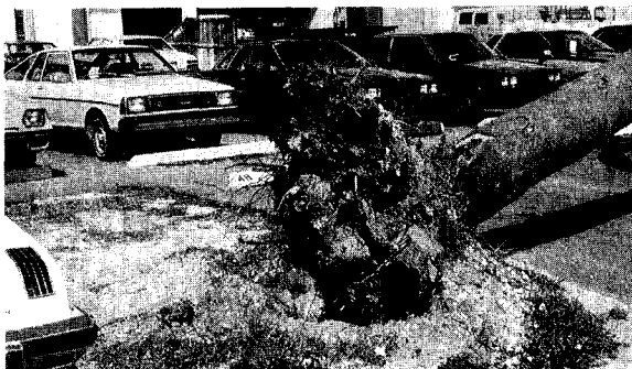
Figure 2. One does not have to be a prophet to know that this tree was a prime candidate for windthrow. In fact, it blew over like a matchstick in a thunderstorm in which winds reached 40 mph (estimated). Note absence of root system. Trees which are seriously stressed due to construction damage, insects or diseases should be removed to protect life and property.