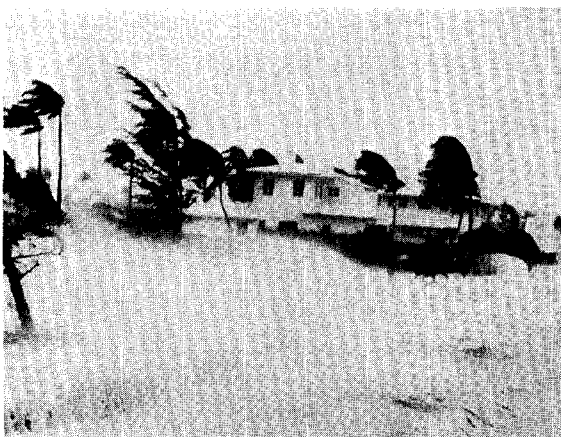
Figure 4. The effects of salt spray may be felt anywhere from a few miles to 40 or 50 miles inland. Salt damage was experienced as far inland as 45 miles following the New England Hurricane of 1938. Leaching root systems and watering foliage will help minimize salt damage. hurricane of September 1947, Miami Beach, FL.

paints have proved to be effective, nontoxic, and durable and can be painted on the main stem.