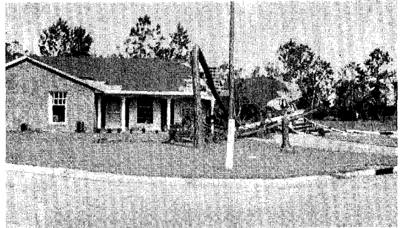
Figure 3. Tall, densely crowned trees with little taper are prime candidates for breakage and windthrow in hurricane-force winds. Each landscape should be surveyed to identify "dangerous" trees that could pose a threat to life and property (see tables). Consideration should be given to removing dangerous trees if they are within striking distance of a building.