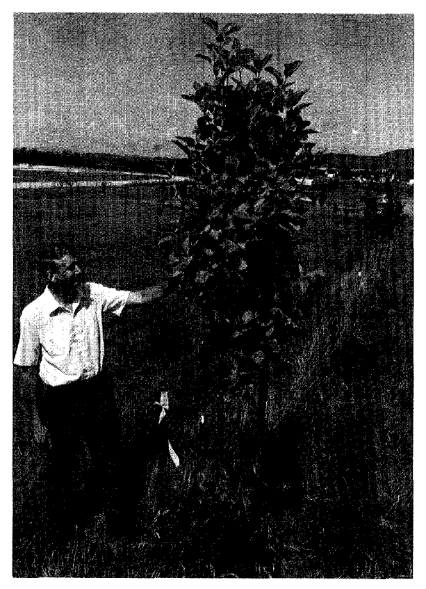
2. Several promising Dutch cultivars have been imported and are being tested at The Pennsylvania State University.

The Research Station for Arboriculture in