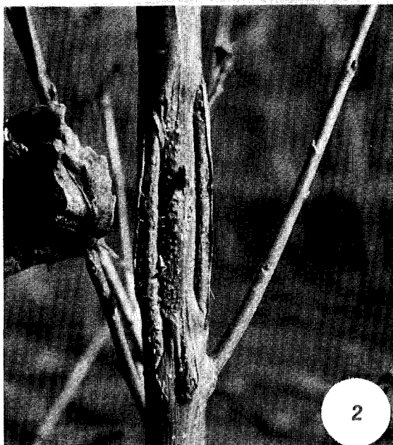
Fig. 1, 2. Main stem cankers on 'Robusta poplar' caused by Phomopsis macrospora .