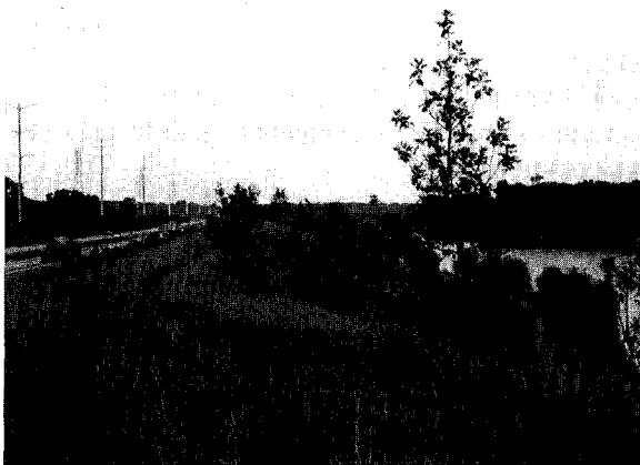
Fig. 4. Berm constructed for noise abatement and aesthetic treatment in subdivision adjacent to a major four-lane highway.

A recycling program for elm wood is operated at this site. As the contractor removes elm trees they are stored on the site for disposal as saw logs or chipped wood. A contractor is used to chip the limb wood. Saw logs are sold directly to the sawmill operator. The forestry section sells the chip wood to landscapers and residents at a delivered price of $7.00 per yard or $5.00 per yard if picked up on the site. The funds generated are used to offset the cost of chipping. The program has worked very well this past year. The major problem experienced is the reliability of the sawmill operator. He wants the logs but is not