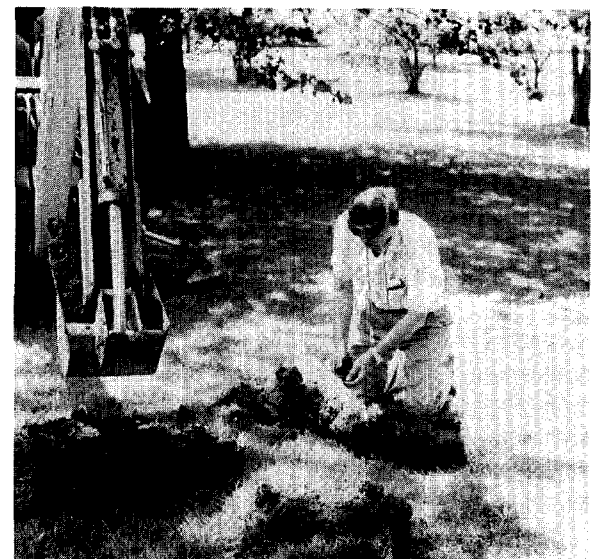
Fig. 3. Plant Pathologist Dr. Eugene Himelick examines rootlets of oak in chip mulch experimental chlorosis control program.

mulching the soil surface under the trees with wood chips. A recent inspection of the root systems of the oaks has determined that a more fibrous root system is being established than in untreated areas. In past years the program seemed to indicate the oaks treated were improv-