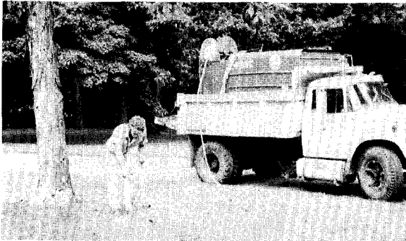
Fig. 2. Large skid-mounted hydraulic sprayer used for tree feeding and spraying for insect and disease control.

they come from. If they came from the northeast an employee is sent to check their property to determine if gypsy moth egg masses have been brought in on their lawn furniture as a result of this program.