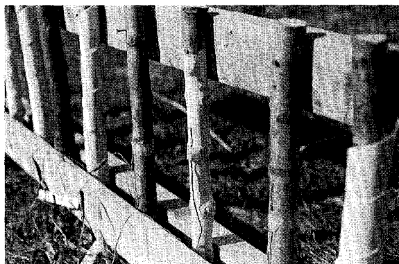
Figure 1. White ash sections on frame showing thermocouple placement and various materials tested.