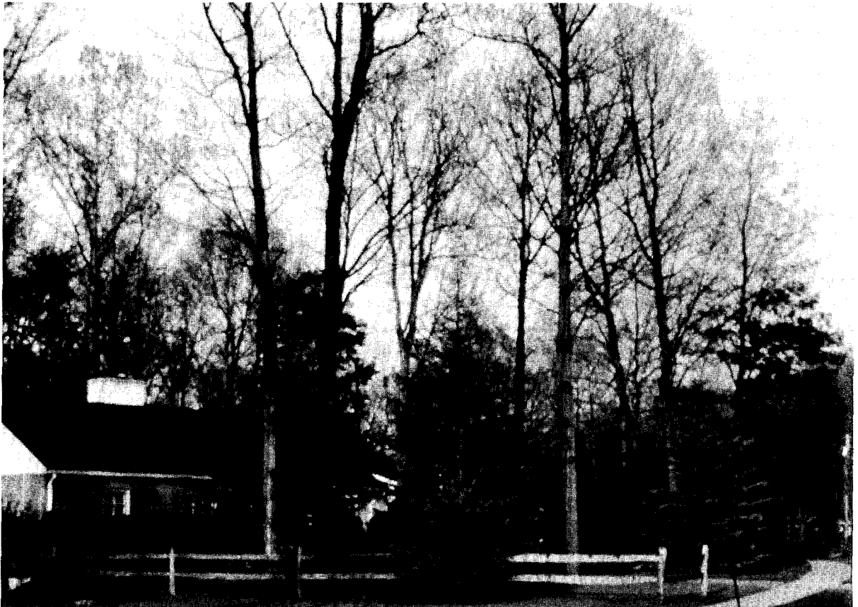
Fig. 2. Residential area defoliated in early July. Note heavy defoliation in tops of conifers as well as on hardwoods.

The larvae change behavior about halfway through their development. At about the 3rd or 4th instar, or when the larvae are about 3/4" or 1" long, they become nighttime feeders. During the daytime, they crawl down from the crowns of the trees to seek a protected or concealed place during the daylight hours.