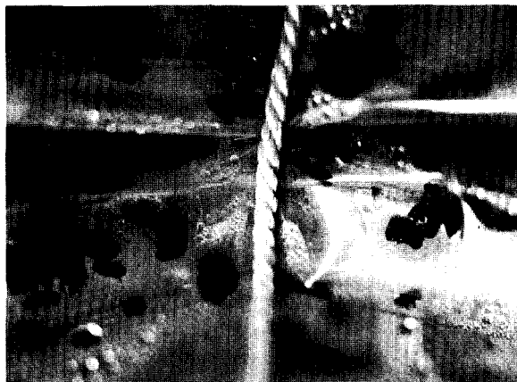
Figure 4. Both living and dead elm bark beetles were found congregated at the top of the woodpiles.