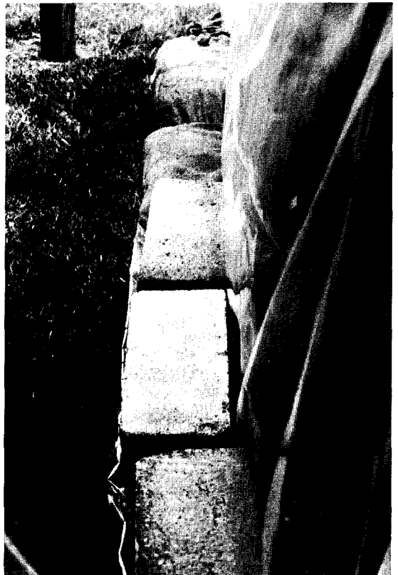
Figure 2. Two possible methods of sealing woodpiles are shown here; placing sandbags or concrete blocks on the excess polyethylene.