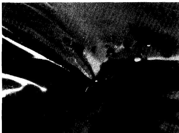
Figure 3. Elm bark beetle "escape" holes were noticed in the black polyethylene tarps wherever the tarps were pulled taut.