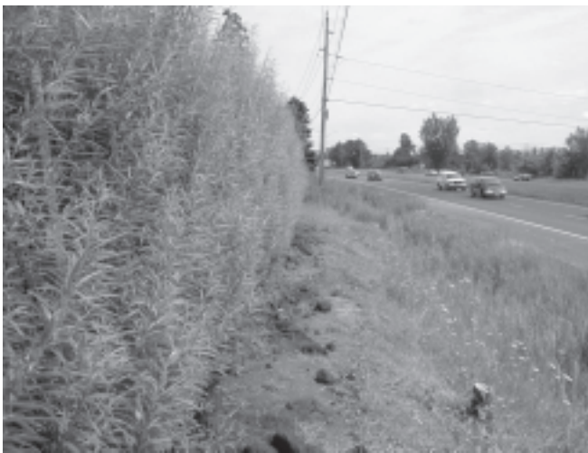
Figure 3. About 8 weeks after establishment, the wall was completely green.

*On the same line, means with the same letter are not significantly different at P < 0.05 .