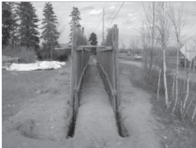
Figure 2. Stems are assembled tightly in a wooden frame and installed upright in two trenches set 1.2 m (4 ft) apart.