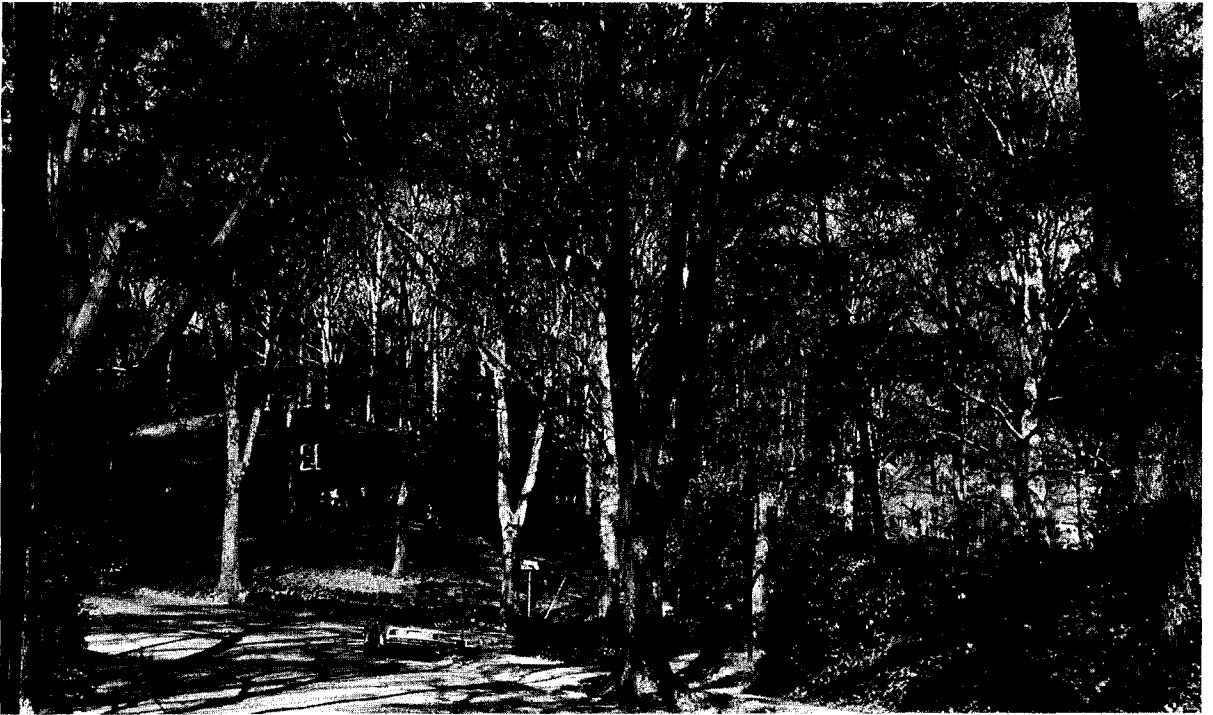
There's a forest in the cities.