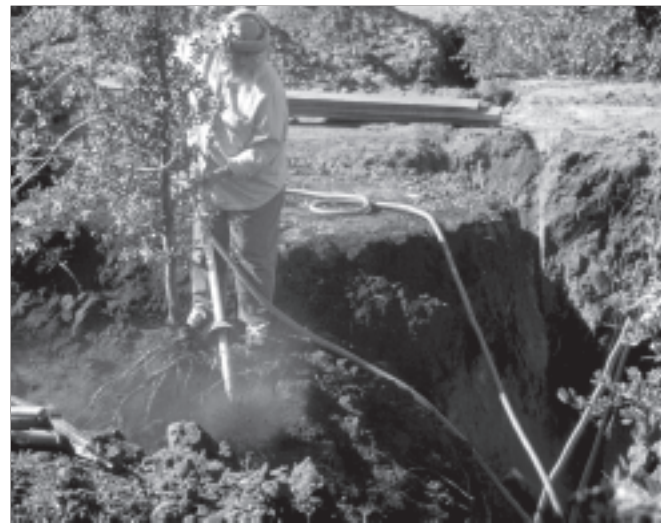
Figure 1. After 4 years, root systems of coast live oak were fully excavated using a pneumatic excavation tool (Air-Spade®), backhoe, and jackhammer.

Following excavation, intact root systems were removed from the field, suspended from a greenhouse roof beam, and