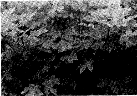
Fig. 3. The canyon maple ( Acer grandidentatum ), a western sugar maple with outstanding fall leaf color was a survivor in the study.