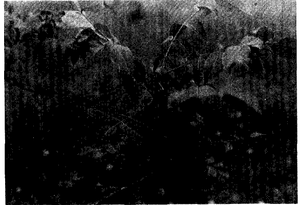
Fig. 4. Chinese pistachio ( Pistacia chinensis ), an exotic species, displayed its drought hardiness in surviving the severe soil stresses.

Acknowledgment. Land for this study was made available by the Division of Environmental Management, University of Texas at San Antonio. Plant material was made available by the Rare Plant Studies Center, University of Texas at Austin, The Texas A&M University Research and Extension Center at Dallas, the city of San Antonio and Fanick's Nursery of San Antonio.