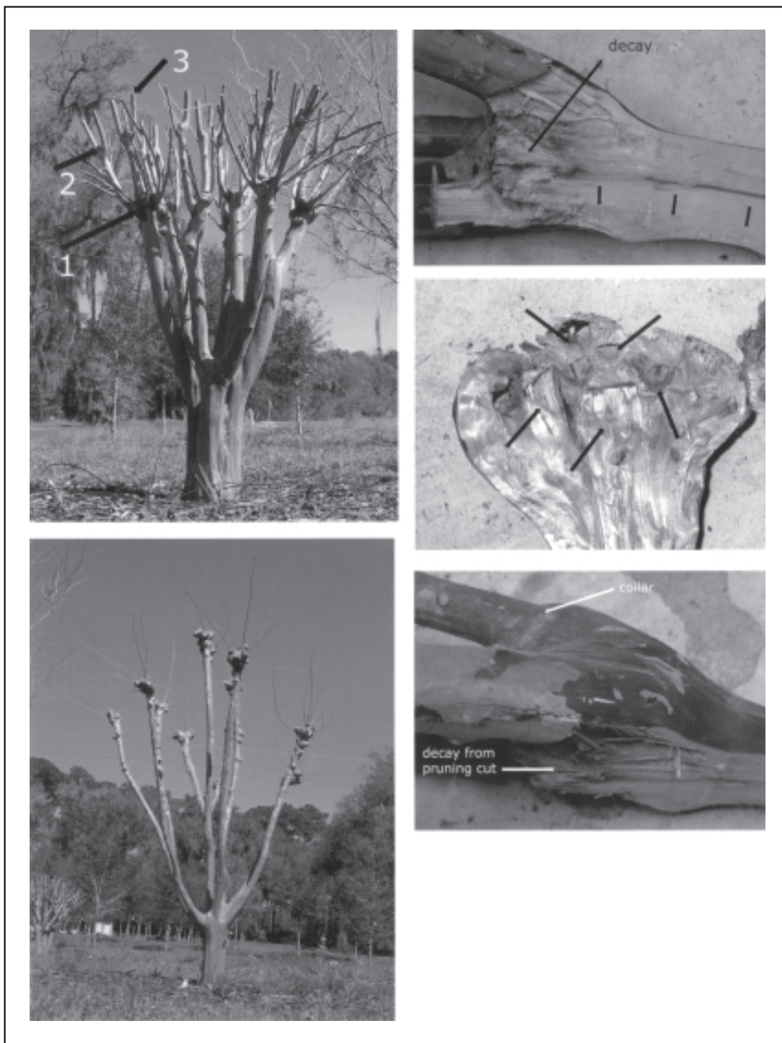
Figure 1. The first (1), second (2), and third year (3) pruning cuts are clearly visible on topped trees (upper left). Pollard heads were prominent after the fourth year of removing sprouts back to the same position (lower left). Decay is clearly visible on topped trees behind the original heading cut made in 1998 (upper right); the barrier zone can be seen streaking back behind the heading cut (three small arrows). Small pockets of decay were restricted to the base of all sprouts in the pollard heads (middle right); arrows indicate protection zones that retarded decay. Sprouts that remained small compared to the largest sprout formed a visible collar (lower right).