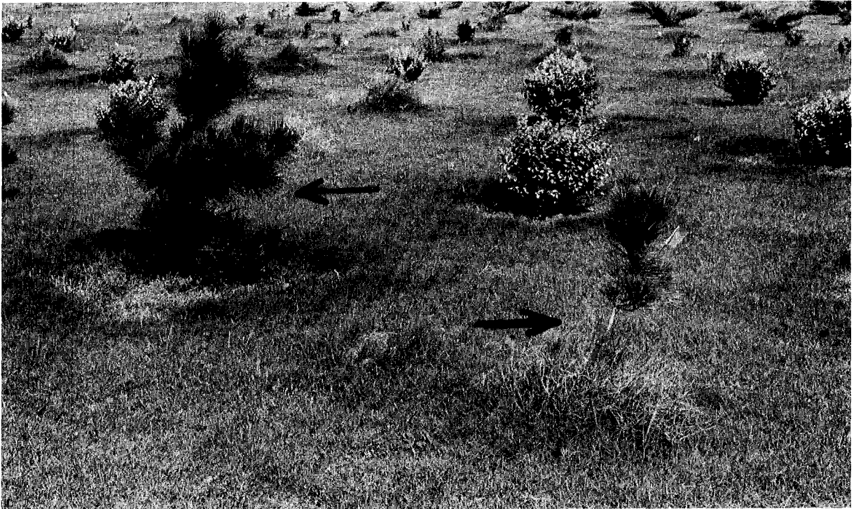
Fig. 2. Growth of Japanese Black Pine with additional fertilizer and 60" clearing (left) and with no additional fertilizer and no clearing (right).

tained. Fertilizer only slightly increased juniper growth, with or without the bermudagrass competition.