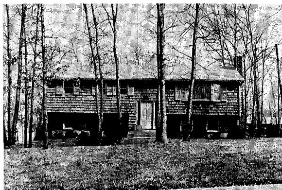
Figure 1. Example of a house with good tree cover.