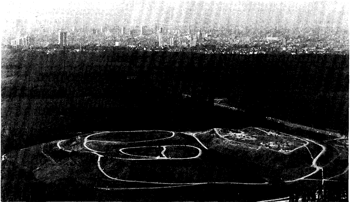
Fig. 2. View of Frankfurt and a portion of its 600 year old peripheral forest belt. This forest is managed for timber, watershed protection, climate modification and especially recreation. A former eyesore, 20 million cubic meters of garbage were converted into a major recreational attraction, Monte Scherbelino in the foreground.

Major momentum for the greening of cities has come from the federal and international garden fairs hosted by different cities at two and ten year intervals, respectively. Generous federal funding for these events can completely alter the appearance of a city and have a lasting impact. Preparations for these garden fairs usually promote the implementation of a recent planning concept which attempts to mesh existing green spaces into a green web (Fig. 3) permeating the