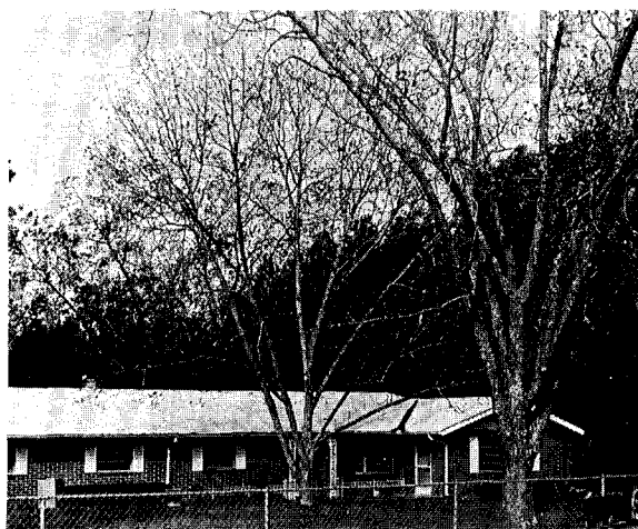
Fig. 2. Pecan trees used for landscape and shade around a home.

suggested adequate range for leaflet Zn in pecan trees is 50-100 ppm (Worley 1971). Zinc deficiency causes rosette, a disease which at one time affected most pecan trees in the South.