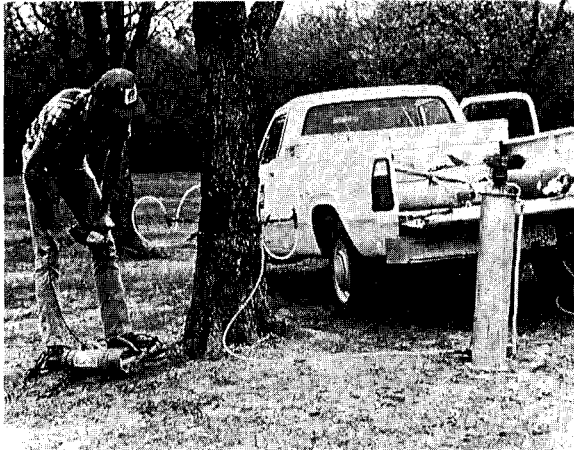
Fig. 7. Equipment used for pressure trunk injection. Note the compressed air cylinder in truck, the aluminum solution tank, manifold, injector heads, and the DC-AC converter for supplying power to the electric drill.

analyzed by using an analysis of variance with Duncan's Multiple Range Test. A square-root transformation was used on the leaf analysis data to meet the assumptions of normality required by analysis of variance.