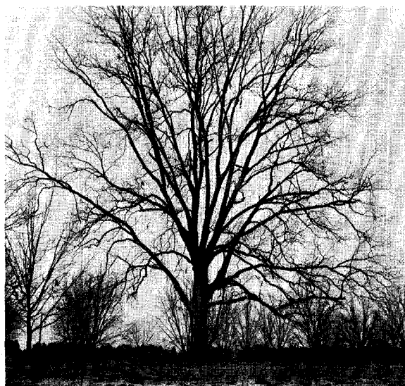
Fig. 3. Large 'Seedling' pecan tree near an old home site on Fred Volgt farm near Waycross, GA.

Alben et al. (1932) discovered rosette was caused by Zn deficiency, and since that time Zn applications to pecan trees have been routine. This discovery combined with development of fungicides to control scab and other leaf diseases, insecticides to control insect pests, and the development of sprayers that could apply these chemicals to large pecan trees has saved the pecan industry. Rosette can usually be easily controlled by soil application of Zn in acid soils of the Southeast, but it often takes several years to correct the deficiency after it becomes visible (Worley et al. 1972). In the alkaline soils of the Southwest, it is almost impossible to correct rosette by soil applications (Storey et al. 1971). In the Southeast, therefore, there is need for methods that will give rapid correction of Zn deficiency until soil applications take effect and in the Southwest, a method other than soil application is required. Foliar application is recommended in the Southwest (Storey et al. 1971), but several applications are required and the correction is often temporary. Trunk injections or implants may, therefore, be a method of application that will be both effective and rapid.