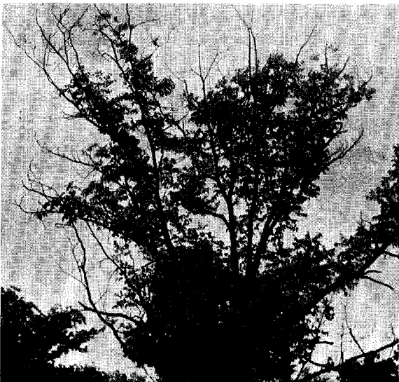
Fig. 5. Severe Zn deficiency causes tips of pecan limbs to die.

ly stunted due to neglect and Zn deficiency. The orchard had been under improved management for 6 years prior to the study. Management included spraying for insect and disease control and application of fertilizer based on leaflet analysis. Although Zn had been applied, trees were still deficient in Zn and showed symptoms of rosette. Treatments were applied on April 3, 1979 when spring shoots were approximately 2-3 cm long as follows: 1) One 2.5 × 1.2 cm implant (2 g ZnSO 4 ) (Medicap Zn, Creative Sales, Inc., Fremont, NE 68028)/10 cm of trunk circumference in a spiral around the trunk within 1 m of the ground (1X). 2) Same as 1, but implants were spaced every 5 cm (2X). 3) One 2.5 × 1.0 cm implant (1 g ZnSO 4 )/10 cm of trunk circumference as in 1 (½X). 4) One g ZnSO 4 /2.5 cm of trunk circumference injection in 8 l of water through 6 ports in each tree at 5.3 kg/cm 2 pressure. 5) One pressurized cartridge containing 4 ml of 2% Zn derived from metal chelate of ethylenediamine tetraacetate dihydrate (EDTA)/12.7 cm of trunk circumference (J.J. Mauget Co., Burbank, CA 91504). 6) Control — no added Zn. Treatment 2 and 4 supplied equivalent Zn to the tree. The implants were driven just beneath the cambium layer into a drilled hole of the appropriate diameter. The capsule