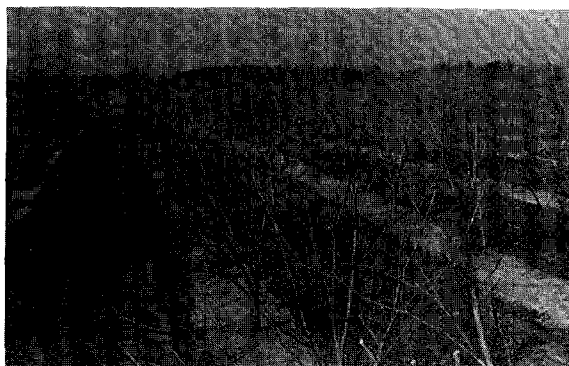
Fig. 1. A commercial pecan orchard near Albany, GA.

Pecan trees require relatively high leaflet Zn concentration compared with most crops. The