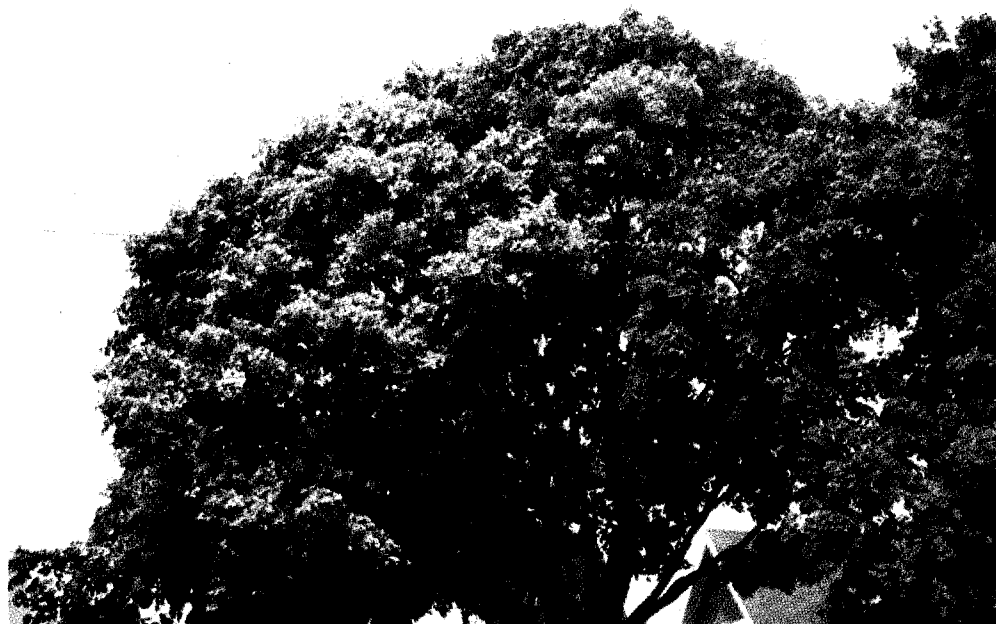
Figure 4. Manganese trunk injection elicited irregular response.

At the time the leaves were evaluated for color, samples were taken from each tree for tissue analysis. Leaves from both the tree and branch study were analyzed with the assistance of Dr. Elton Smith, extension horticulturist for Ohio State University. The data were grouped according to color evaluation regardless of the treatment. Unfortunately, the samples were not analyzed for nitrogen but a definite pattern was established for the other elements. The information for leaf samples rated as 1 and 2 was combined under Healthy , and for 9 and 10 under Chlorotic , in