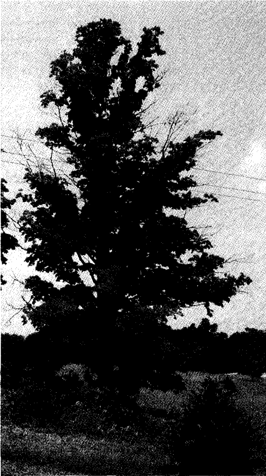
Figure 2. Year two. Advanced symptoms of maple decline. Tree fertilized with high nitrogen, complete fertilizer.