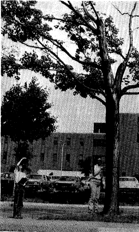
Fig. 1. Quality control during data collection, processing, and retrieval is essential. High standards of quality are built into TRESYSTM methods.

Several types of optional products are available or under development. These can be produced upon request at any time of the year. They can assist the arborist in improving the effectiveness and efficiency of his program over the years.