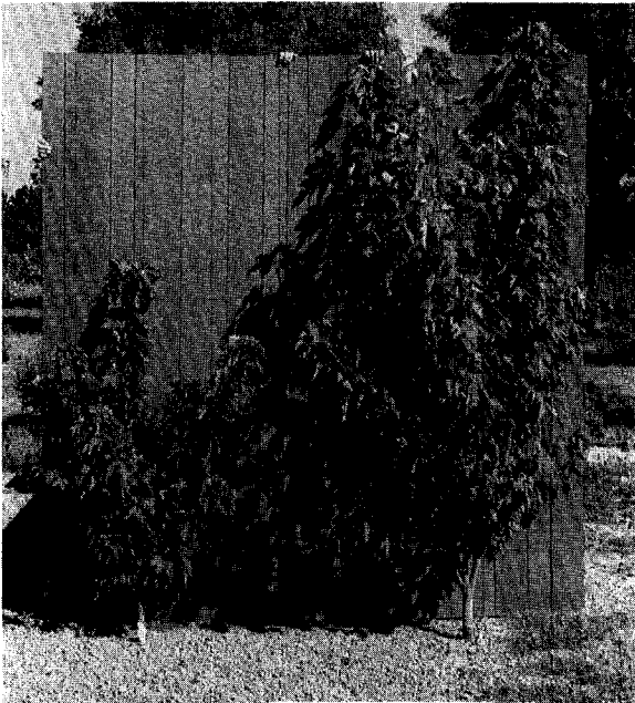
Figure 2. Growth of Silver Maple trees with 20% pine bark in the backfill (left) and with no soil amendment (right).

Mulching has long been a standard gardening practice. However, the practice of placing black polyethylene beneath the mulch to conserve more moisture and serve as a barrier to weeds should be questioned. A study was designed to determine effects of no mulch, pine bark mulch (2 inches deep) or pine bark mulch with plastic beneath three levels of fertilizer (0, 2 and 4 lbs. N/1000 sq. ft.) with each treatment (4). Sawtooth oak, Quercus acutissima , Chinese pistache, Pistacia chinensis , Pfitzer juniper, Juniperus chinensis 'Pfitzeriana', and Burford holly, Ilex cornuta 'Burfordi,' were used as test plants. The first summer was very dry and no irrigating was done. Plants with both mulch treatments increased in growth as fertilizer level increased. By contrast, those plants with no mulch showed no benefit from the fertilizer. The following winter 96% of the Pistacia chinensis trees with black plastic beneath the mulch were killed back to the mulch surface, while trees in other treatments were not damaged. Fertilizer level had little effect on winter injury.