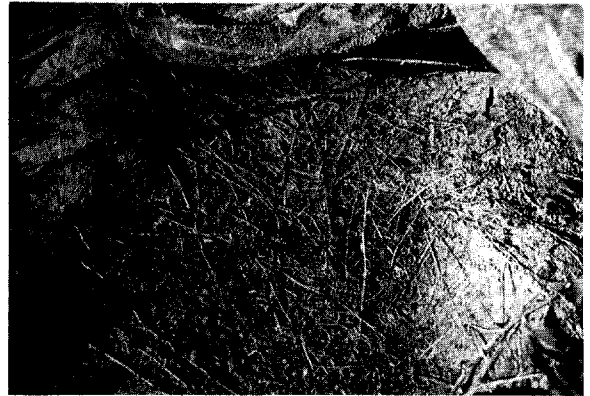
Figure 3. When black plastic is used beneath a mulch, oxygen level is reduced and roots remain at the soil surface.

Plastic restricted the root development of all plants and did not provide additional weed control benefits. Roots developed in a thin layer beneath the plastic (Fig. 3).