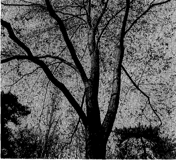
Figure 2. The gray bark and prominent lenticels distinguish Himalayan small-leaved elm from others growing at the Royal Botanic Gardens, Kew, England.