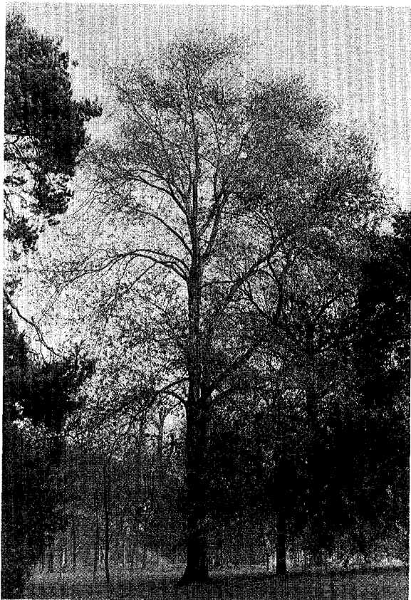
Figure 1. Himalayan small-leaved elm has grown well in England. Note leaf retention in December, 1975.

The rooted cuttings were potted and grown outdoors during 1976. The plants had to be staked in order to develop upright stems. Probably as a result of fertilizer treatment, growth had not ceased at the time of the first frost in Washington, so the plants were placed in a cool greenhouse for the winter of 1976-77. In 1977, the plants were transferred to 5-gallon cans and grown outdoors. By the end of the growing season the plants averaged 4 feet in height and about \frac{3}{4} inch in caliper. Terminal growth had stopped before the first killing frost (October 18) and no cold damage was noted up to December 1, 1977.