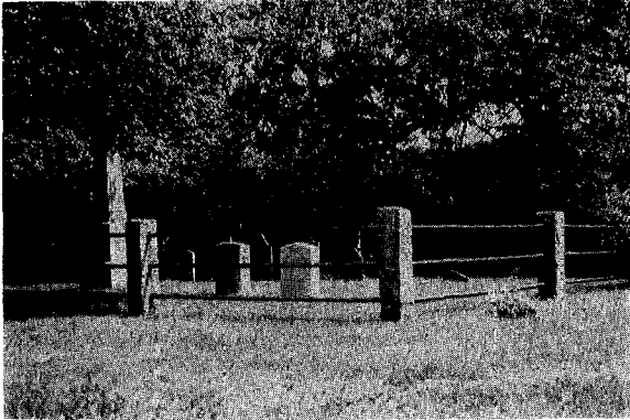
The family cemetery dates to the early 1600's.

Conservation Educator, Urban Forestry Center Division of Forests and Lands New Hampshire Department of Resources and Economic Development Portsmouth, New Hampshire