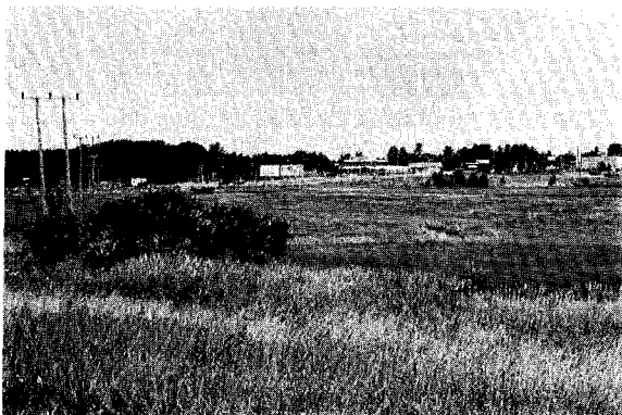
Looking northwest, a reminder of adjoining urbanization and U.S. Route 1.