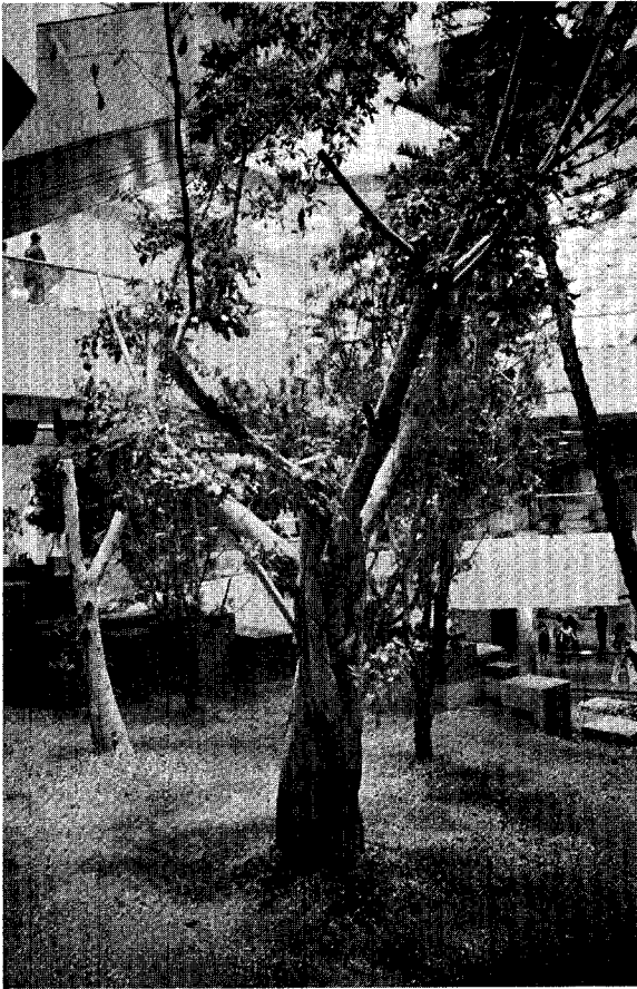
Fig. 2. Royal Bank

by soil moisture, and in my opinion, should be eliminated from all indoor media. It is virtually impossible to control release during periods of low light and little growth; subsequently, a rapid buildup of salt levels occur, compounded in this case by additions of a soluble fertilizer. Visual symptoms such as leaf necrosis in new growth, stem rot, etc., are similar to those of overwatering; therefore a soil test for total salts is the best confirmation of the visual diagnosis.