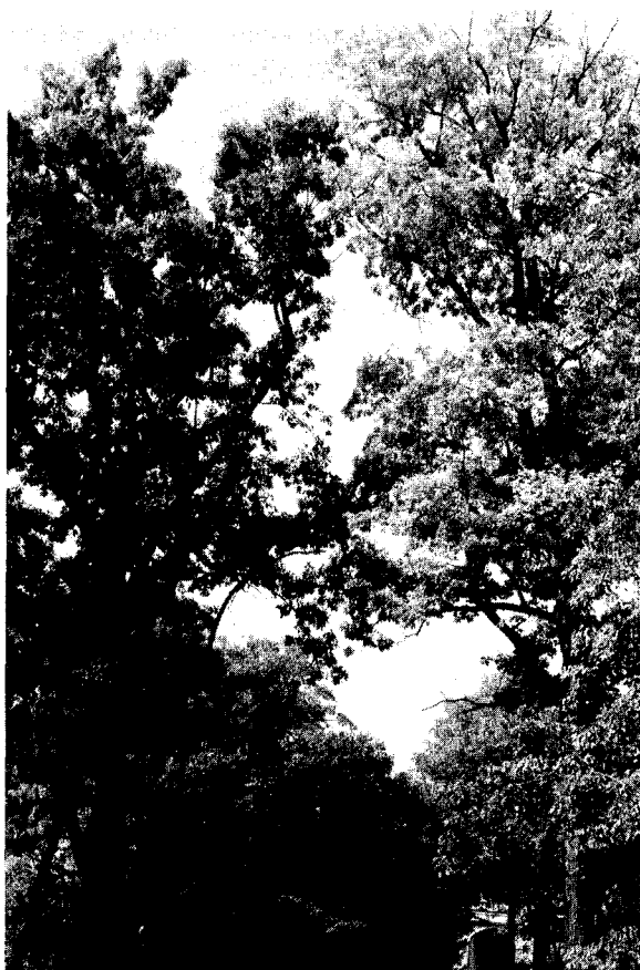
Figure 1. White oak. (L) Treated with ferric ammonium citrate capsule implants in March. Photo taken in September. (R) Untreated.

Iron deficiency is common on most all oak species but especially pin and white oak in alkaline or poorly drained soils. In addition, iron deficiency is to be expected in white pine, sweet gum and magnolia. Correct with 1) chelated iron sprays or 2) implants of ferric ammonium citrate since this treatment remains effective for two to three years especially with oaks. For best results implants should be made before vegetative growth in spring. Capsules should be inserted in a spiral pattern around the trunk of the tree and each insert should definitely be made beneath the cambium to insure proper wound healing. Most wounds of oaks heal completely in one growing season.