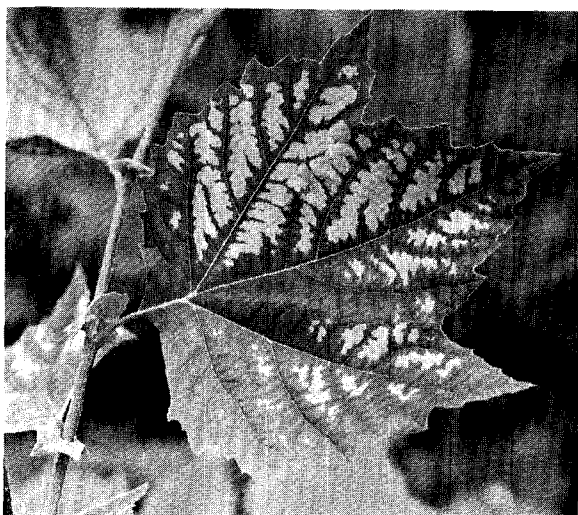
Figure 2. Sulfur dioxide injury in the form of interveinal necrosis on a 'Bloodgood' London planetree leaf. The injury occurred following an exposure to 1.00 ppm sulfur dioxide for 7½ hours.

fects, relative age of leaves affected, injury patterns (i.e., interveinal, marginal, stipple, etc.), and injury color. The pollutants suspected of causing the injury are noted, as well as insect, disease, or other stress factors that might be contributing to the injury. This field test will last a minimum of 3 years for each cultivar tested.