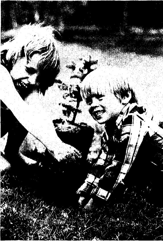
Fig. 5. "The birthday tree time . . . a race to see, who'll be taller — the tree or me."

year a single tree creates absolutely from scratch ninety-nine percent of its living parts. Water lifting up tree trunks can climb 150 feet an hour; in full summer a tree can, and does, heave a ton of water every day. A big elm in a single season might make as many as six million leaves, wholly intricate, without budging an inch; I couldn't make one. A tree stands there, accumulating dead-wood, mute and rigid as an obelisk, but secretly it seethes; it splits, sucks, and stretches; it heaves up tons and hurls them out in a green, fringed fling. No person taps this free power; the dynamo in a tulip tree pumps out ever more tulip tree, and it runs on rain and air . . . The trees especially seem to bespeak a generosity of spirit. I suspect that the real moral thinkers end up, wherever they may start, in botany. We know nothing for certain but we seem to see that the world turns upon growing, grows towards growing, and