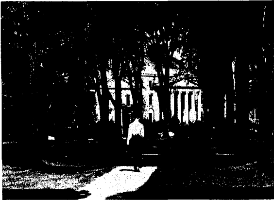
Fig. 1. The University of Vermont Campus Green approximately 35 years ago.