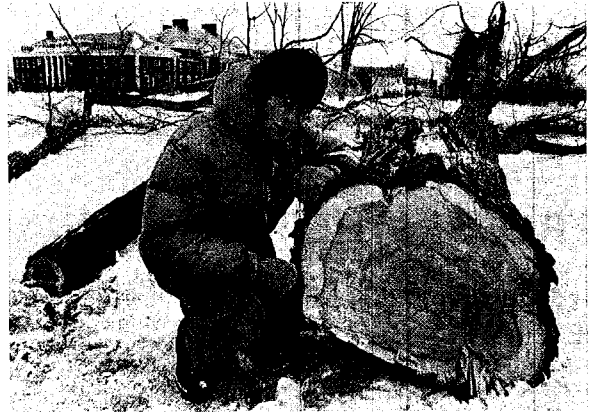
Fig. 2. The University Green today.

suffering similar losses. The scarred landscape which remains represents again and again how tree losses combine with weak or non-existent town-tree ordinances to create a blight far worse than any arboreal disease.