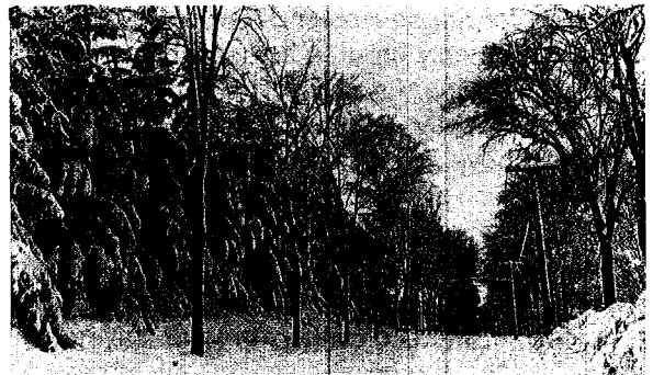
Fig. 3. A tree lined street in Burlington, Vermont approximately 90 years ago (Photo courtesy U. Vt. Archives).

But who is responsible for tree care in our nations? Might we not assume even more