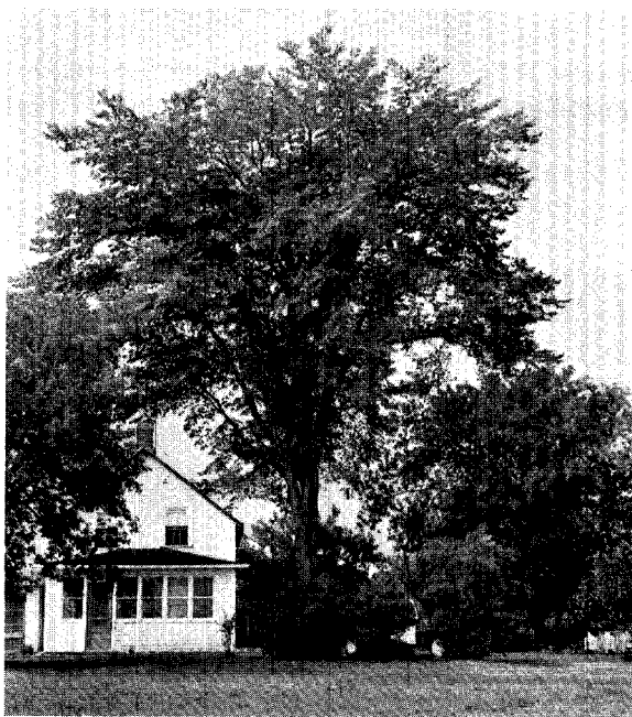
Figure 1. A mature healthy elm injected in 1975 to prevent Dutch elm disease.

An important question to be considered is how extensively infected a tree can be and still be successfully injected. Some disease-free trees are injected as a prevention against DED (Fig. 1).