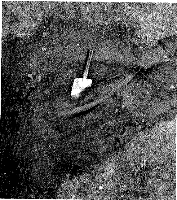
Fig. 2. The soil must be excavated to expose roots with considerable care.

Another factor to be considered is tree location and injectability. It is difficult to excavate a curb-side or road-side tree and this sometimes makes root injection impossible. A tree in a soil with a high water table may also not lend itself to root injection. Then flare injection must be used. This method has not proved as successful as root injection (C.F.S., 1975).