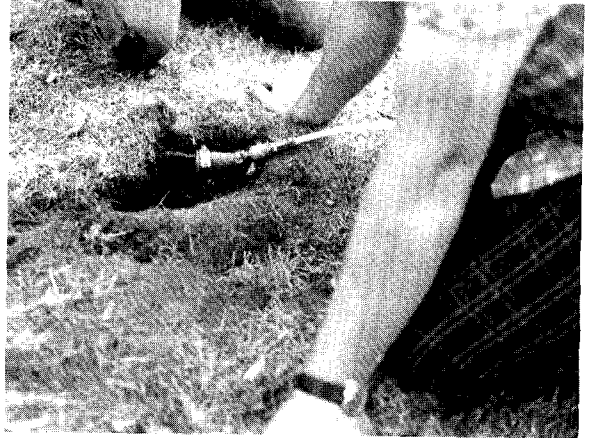
Fig. 3. The roots are cut and a conical root-nipple put over the end.

When the root has been followed out from the tree to the appropriate size, 1-1½ inch in diameter, it is cut and a conical-shaped root-nipple placed over it (Fig. 3).