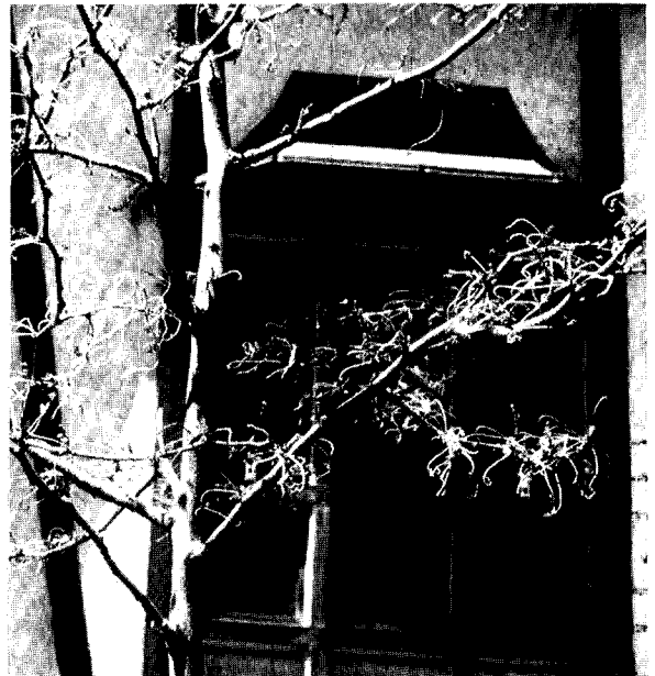
Fig. 1. (a) Distorted growth of honeylocust caused by 2,4-D herbicide drift.

(b) Distorted growth of honeylocust caused by leafhopper and plant bug. Symptoms of the two are easily confused.