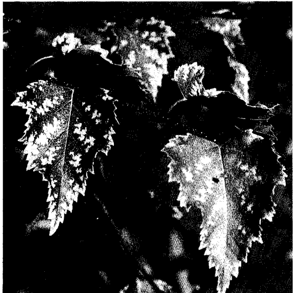
Fig. 3. Interveinal chlorosis in birch from pramitol soil sterilant uptake. Symptoms resemble nutritional deficiencies.