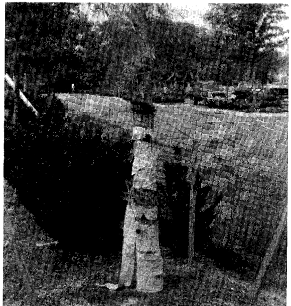
Figure 1 . When tree wrap materials are not removed in a timely fashion, they become not only a visual eyesore, but have the potential to damage the tree.

A good review of materials recommended in the past to reduce sunscald is provided by Litzow and Pellett (15). Recommended materials, primarily for fruit trees, included paper (Kraft), whitewash, white water-base paint, slaked lime, boards and aluminum foil-backed fiberglass, polyurethane, shredded newspapers, aluminum pipe, urethane foam, aluminum paint, and white latex exterior paint (13,22). Litzow and Pellett (15) tried numerous additional materials including white plastic guards (Ross TreeGard), white adhesive gauze tape (Guard-Tex), capillary mats (Water-Mat), polypropylene landscape fabric (Weed-chek Landscape Mat), plastic bubble packing (Aircap