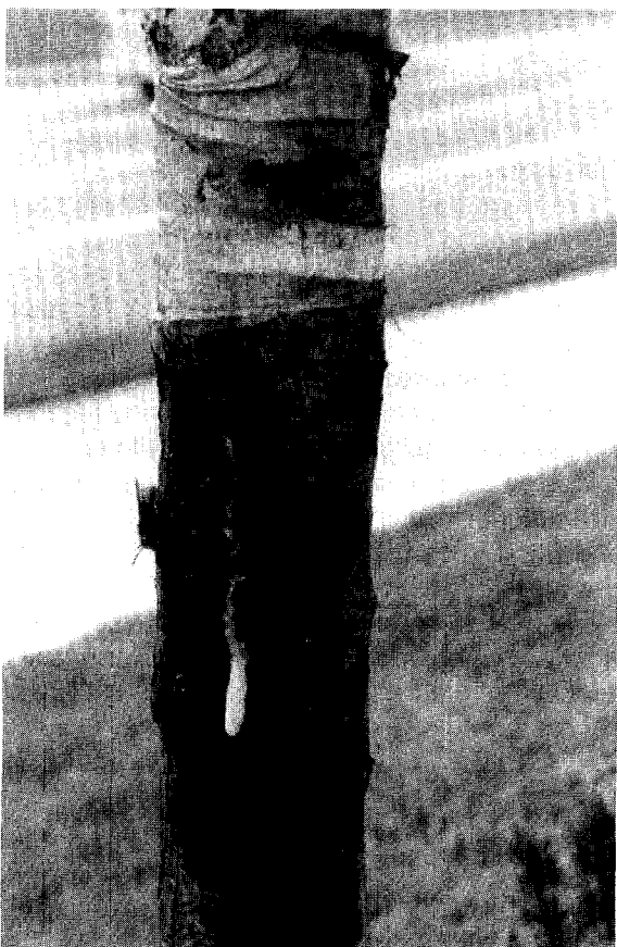
Figure 3. This tree may have been predisposed to insect and disease attack as a result of tree wrap left inappropriately attached (with tape) for too long a period of time

Many members, under appropriate circumstances, try to discourage the use of materials in situations where they feel they are unnecessary or detrimental. When materials are used, their use is generally temporary, with actual or recommended removal being most often after one year. The major exception was when materials were used for purely physical protection against damage from animals, lawn maintenance equipment,