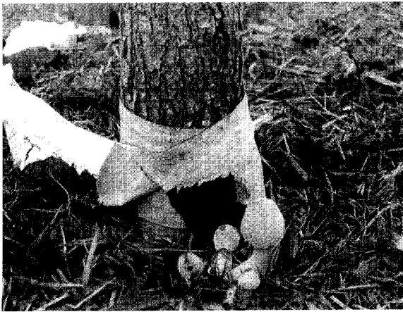
Figure 5. A potentially lethal combination at the base of this tree; tree wrap held in place by a deep mulch layer. The bark and paper wrap were water-soaked and stained, and mushrooms growing on the mulch were evidence of the saturated condition.

other possible pests. Materials need to be tougher, expandable and reflective, and provide better insulation and aeration around the trunks. All this while making a more aesthetically acceptable product for the landscape.