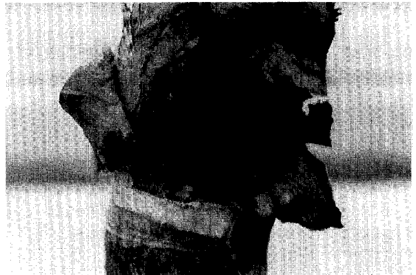
Figure 4. Water-soaked bark, which may initiate fungal decay, was present everywhere that sections of paper wrap were still intact on the trunk of this tree.

When ISA members were asked if they had ever observed damage that they would attribute to the use of some type of trunk protective material, the vast majority said yes. The most frequently seen